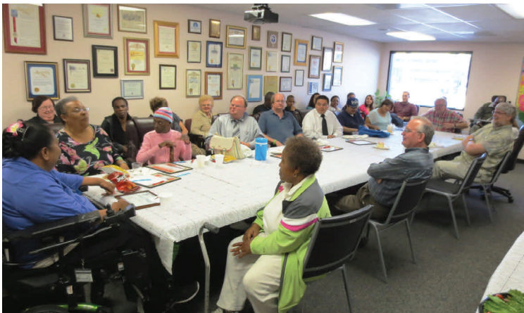
Volunteer Luncheon Class of 2012