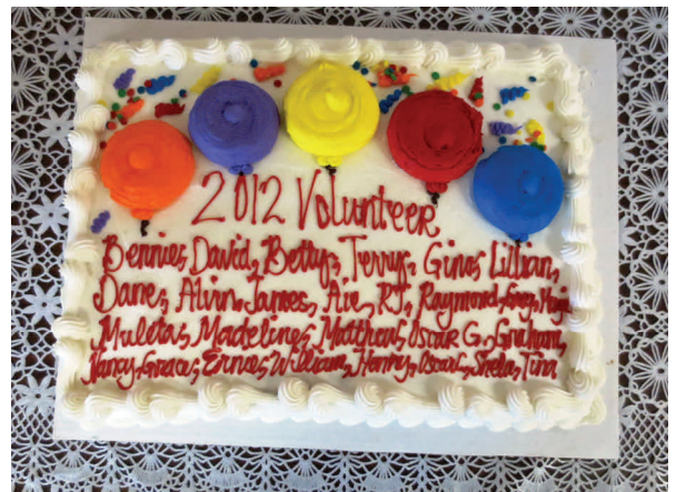
Cake with all of the volunteers' name